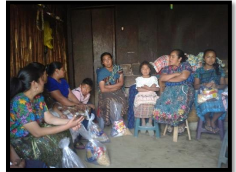
Some members of a recent meeting