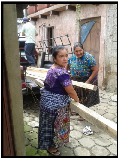
Last year's construction project

First Churches Mission Committee has kindly donated $200 towards Taq Rumial's chicken project for 2014/2015. The ladies are very grateful, and so am I. I hope to send the ladies some photos of the Mission Committee, First Churches families, and our church building. Irlanda is able to borrow a lap top from a friend, so can show emailed pictures. (Continued)